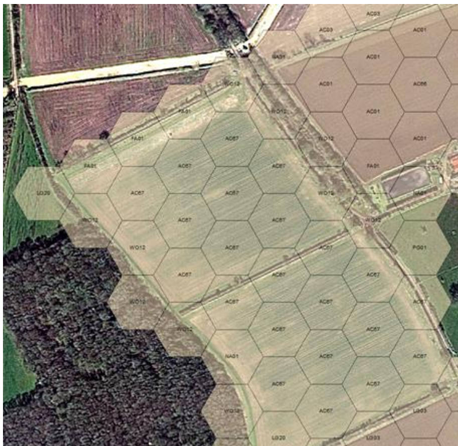
Figure 1. Example of CROME hexagonal classification cells

Each hexagon cell covers an area of 4156 sq. m., or 0.41 hectares. The hexagon cells in the CROME layer are spatially distinct units and the CROME layer does not provide any spatial adjacency information. The vertices of adjacent cells are mostly coincident; therefore, the CROME layer provides a continuous representation of the land use. The hexagon cells are not constrained by any topographic features, except the extent of the land.