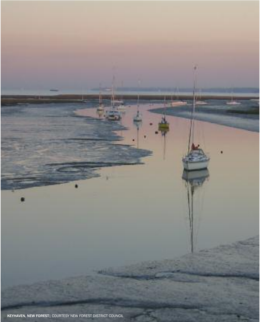
KEYHAVEN, NEW FOREST

The Solent economy is intricately linked to marine activities such as sailing, boat-building, fishing, tourism, heritage sites, recreational sports and leisure. These activities require different types of access and facilities. There are also lots of amenity beaches across the Solent which attract large numbers of visitors each year. The way in which the coastline is managed must be sympathetic to these needs.