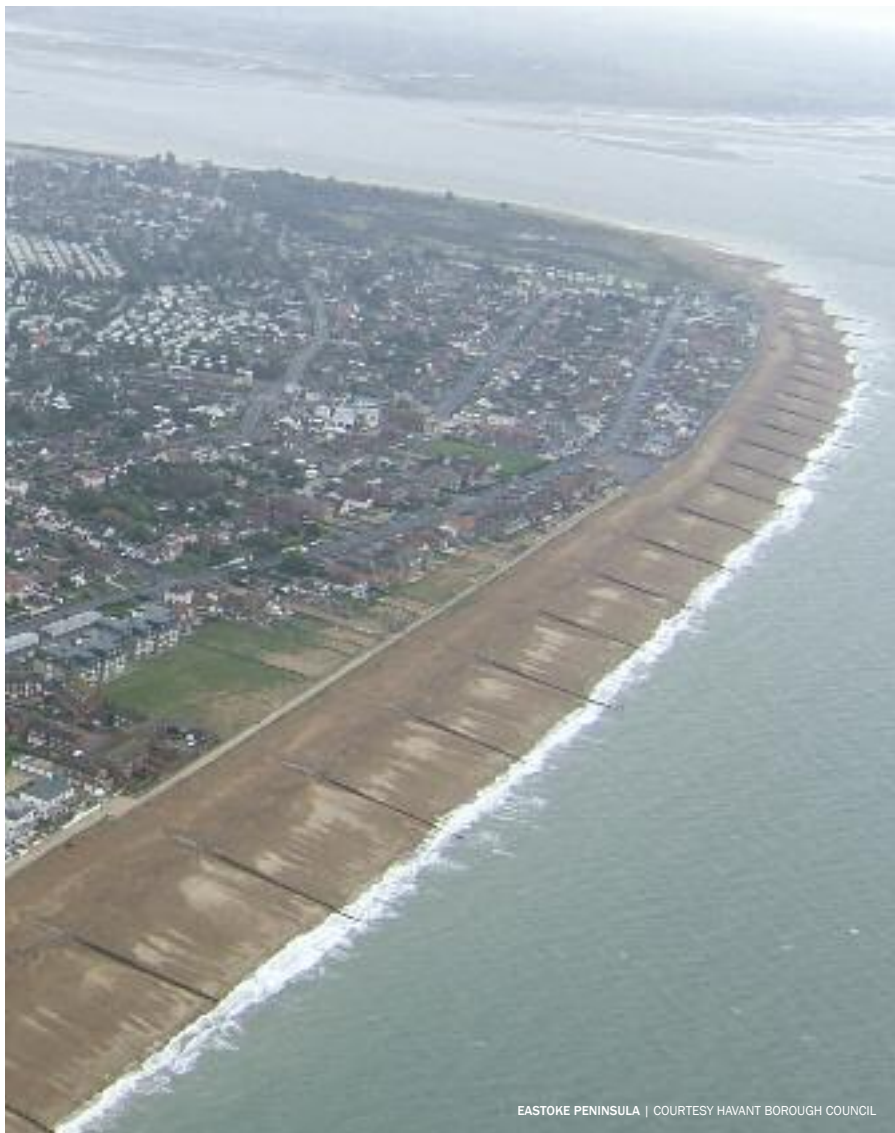
EASTOKE PENINSULA