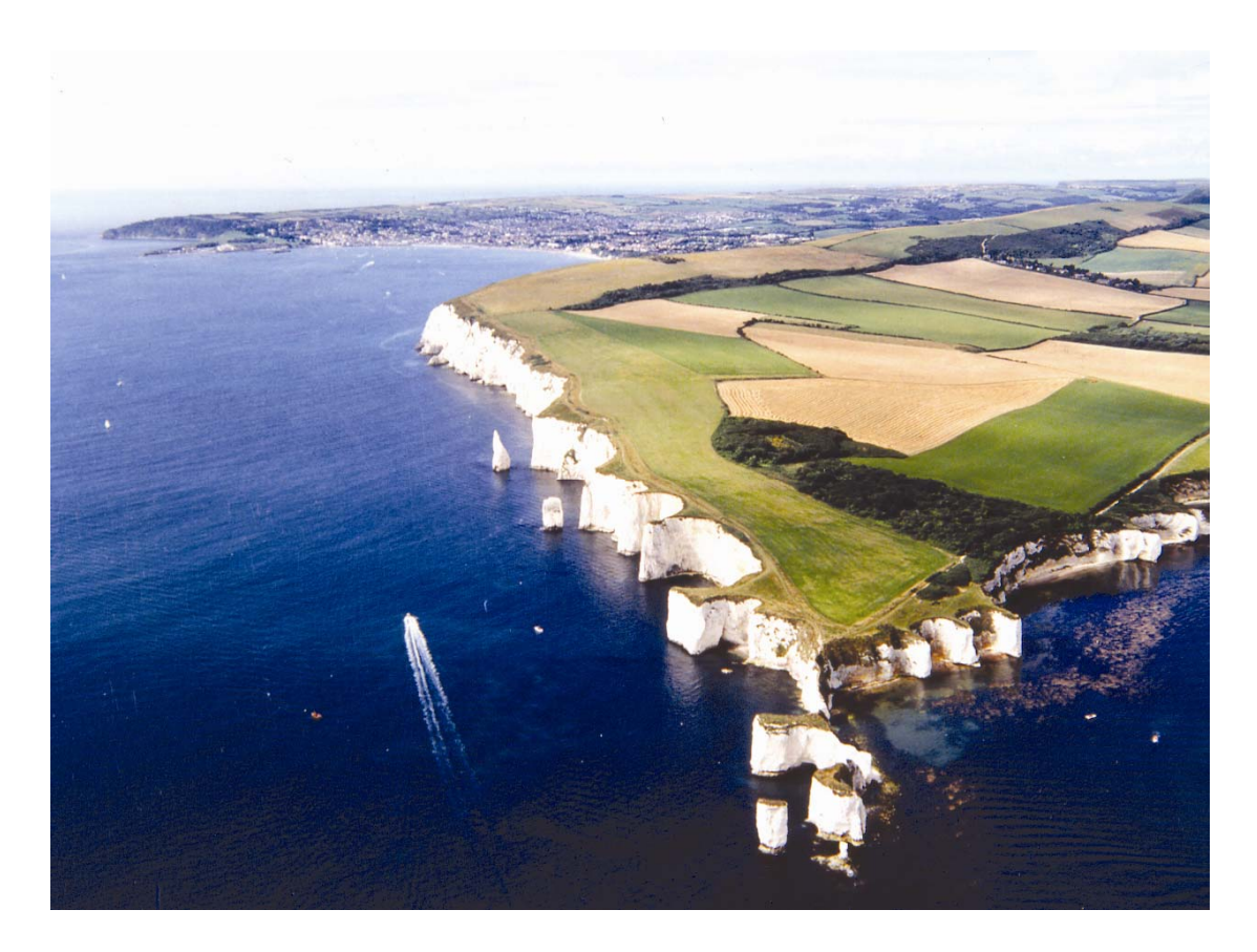
Poole and Christchurch Bays Shoreline Management Plan Review Sub-cell 5f