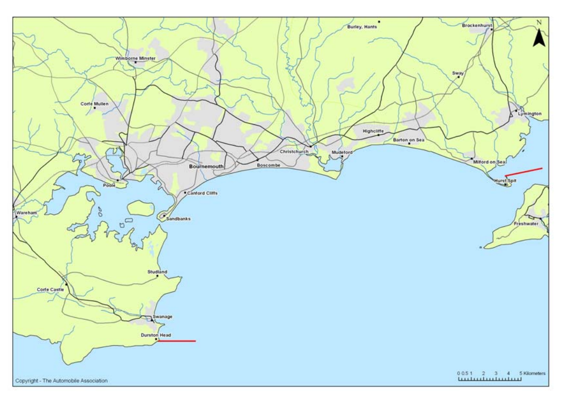
Figure 1.2: SMP Coastline from Hurst Spit to Durlston Head

This SMP2 document, developed on behalf of Bournemouth Borough Council and supporting Client Steering Group (CSG), sets out the results of the first revision to the original SMP for the area of coast extending from Hurst Spit to Durlston Head (Figure 1.1). This SMP2 collates information from the original SMP for sub-cell 5f and subsequent strategies and studies.