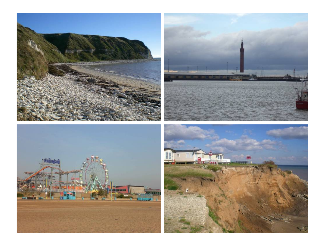
Prepared for Humber Estuary Coastal Authorities Group